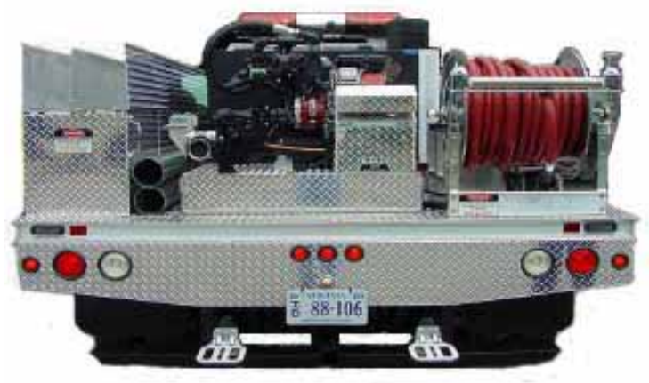
REAR MOUNTED PUMP DESIGN SHOWN WITH OPTIONAL 1-3/4" CROSSLAY HOSE COMPARTMENTS AND BOOSTER REEL