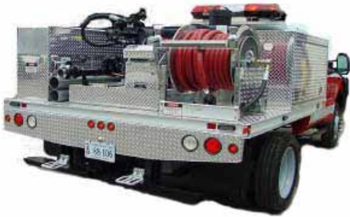
SHOWN WITH AIR PAK COMPARTMENTS, STORAGE COMPARTMENT UNDER PUMP. MANY CHOICES OF PUMPS AND FOAM SYSTEMS ARE AVAILABLE