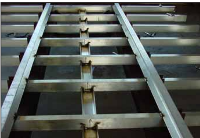
THE BOTTOM VIEW OF OUR 6061T-6 EXTRUDED ALUMINUM SUBFRAME