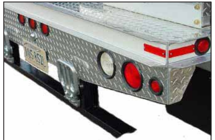
STANDARD FOLDING STEPS, REAR LIGHT PANEL, INCANDESCENT DOT LIGHTS, EXTRUDED RUB RAIL WITH SCOTCHLITE SAFETY STRIPE, LED'S ARE AVAILABLE