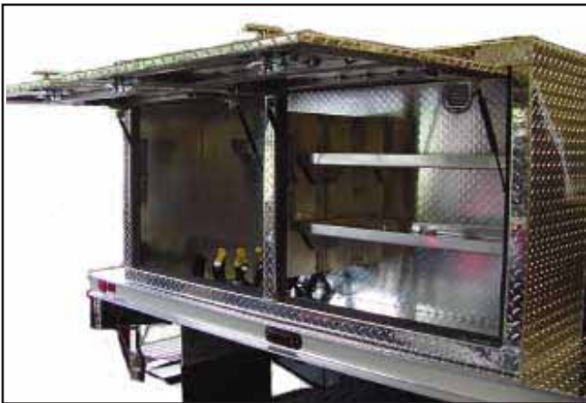
MANY COMPARTMENT DESIGNS, SIZES AND STYLES ARE AVAILABLE. PROBABLY SOME THAT YOU DIDN'T EVEN KNOW WERE AVAILABLE