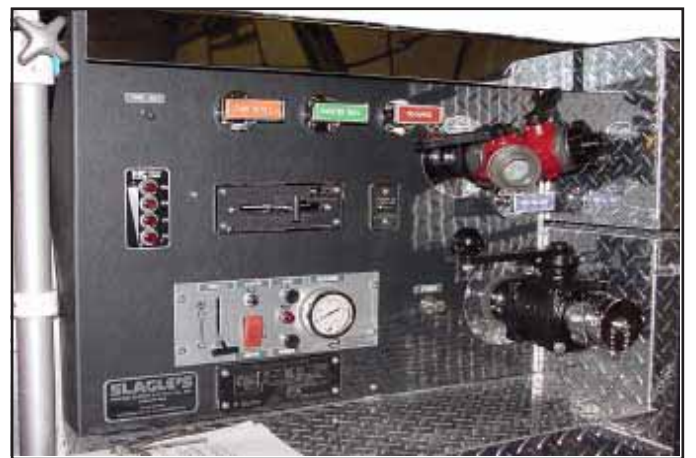
OUR NEW MIDSHIP PUMP PANEL DESIGN FOR BETTER WEIGHT DISTRIBUTION